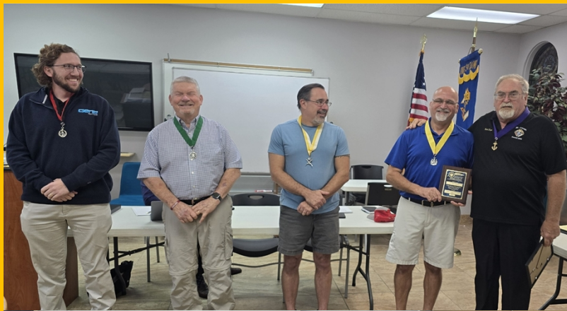
Certificate of Merit Recipients (from left to right)

Pictured below is the presentation of the awards at our November 14 th Business Meeting.